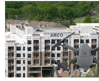
Forum Drone Update: ARCO's NEO Vantage Point