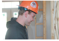
Electrical Connection Donates Services For St. Jude Dream Home