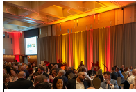
ASA Midwest Council Celebrates Red Carpet Gala Nominees & Winners